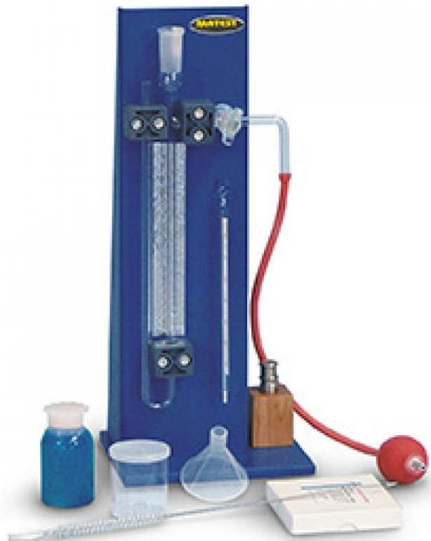
E009-KIT + E055-08