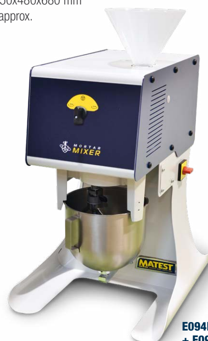
E094NSP + E095-03