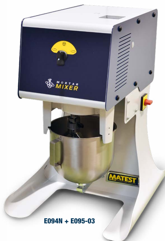
E094N + E095-03