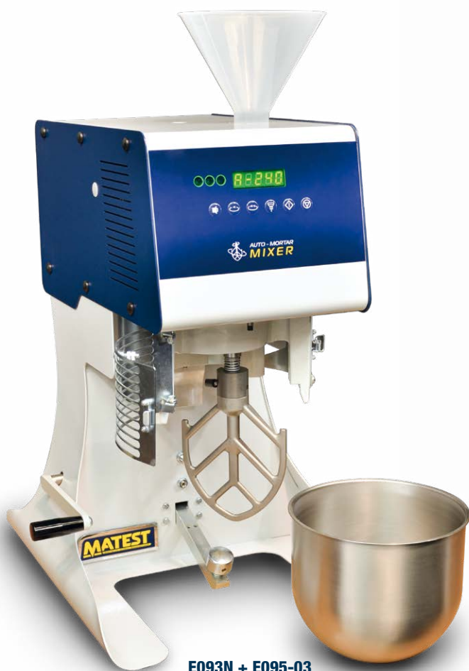
E093N + E095-03