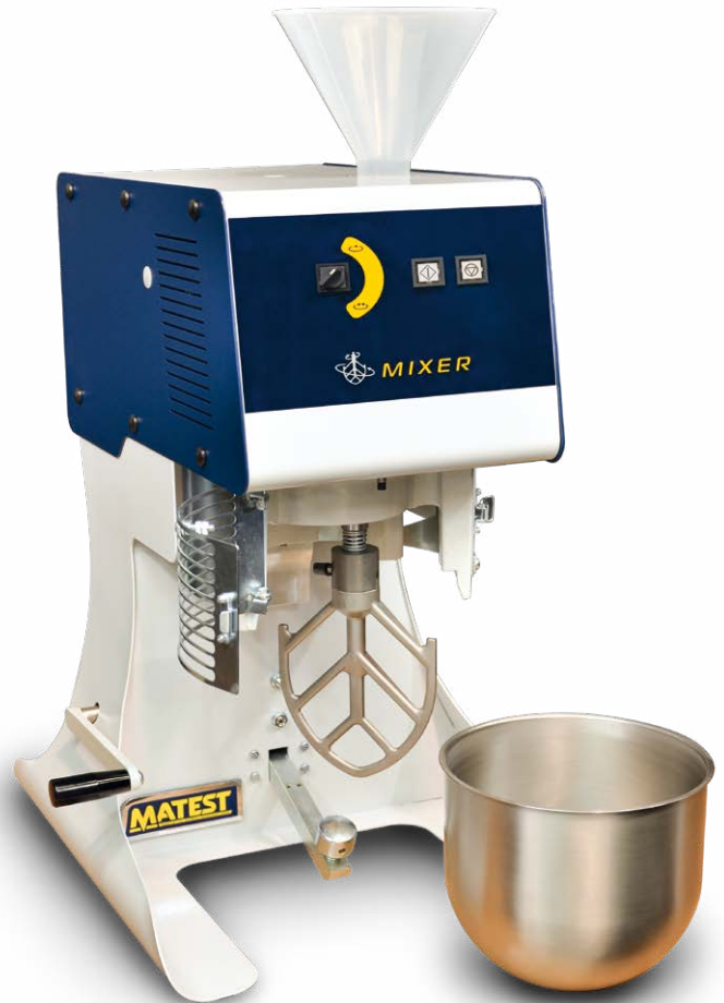
E095N + E095-03