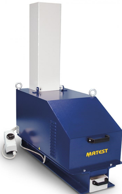
A092 with cabinet