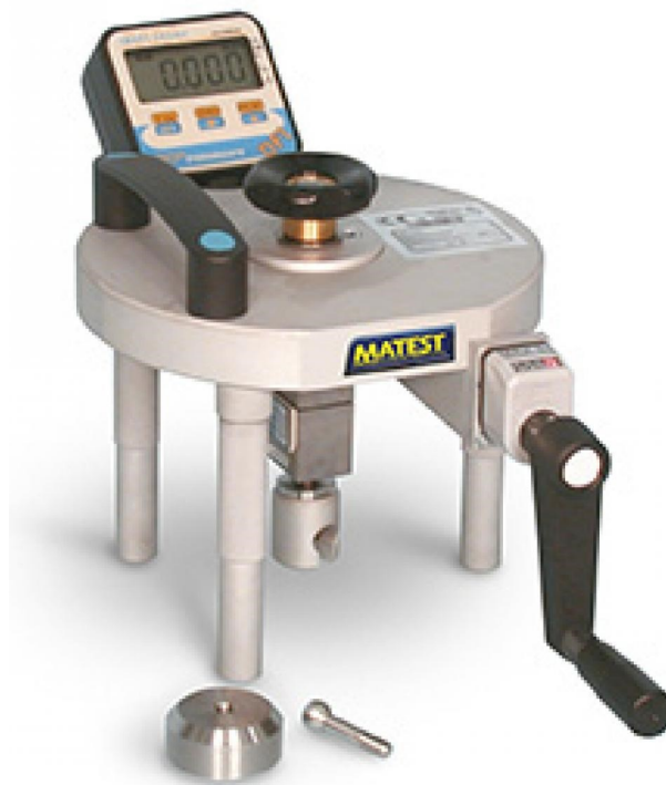
E142 with feet in large position

Compact, light, for use in any location, this Pull-Off Tester is fitted with a load cell and high resolution large digital display unit; it is therefore suitable for measurements from low loads up to 16 kN, granting a wide working range and ideal for a large number of applications and materials. The direct tensile force is applied by rotating the hand wheel.